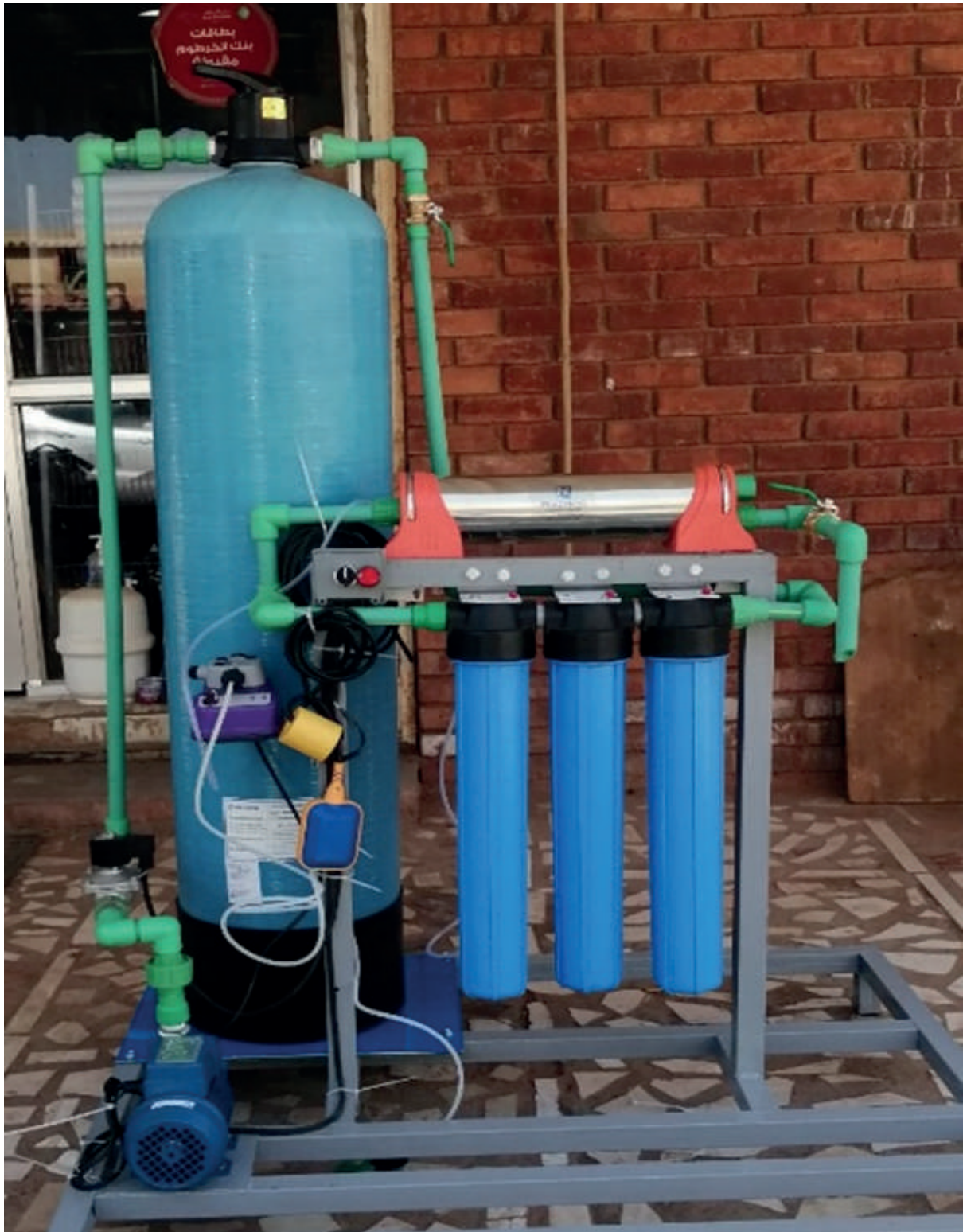
Ultra Filtration Unit for Rural Areas